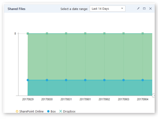
Shared Files Trend